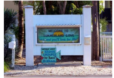
SCCA Event Marque