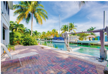
939 E Caribbean Drive