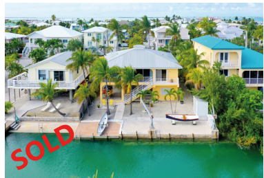
947 Gulf Drive