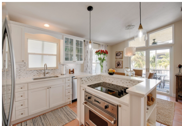
637 E Caribbean Drive