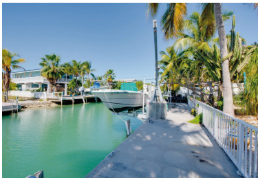
868 E Caribbean Drive