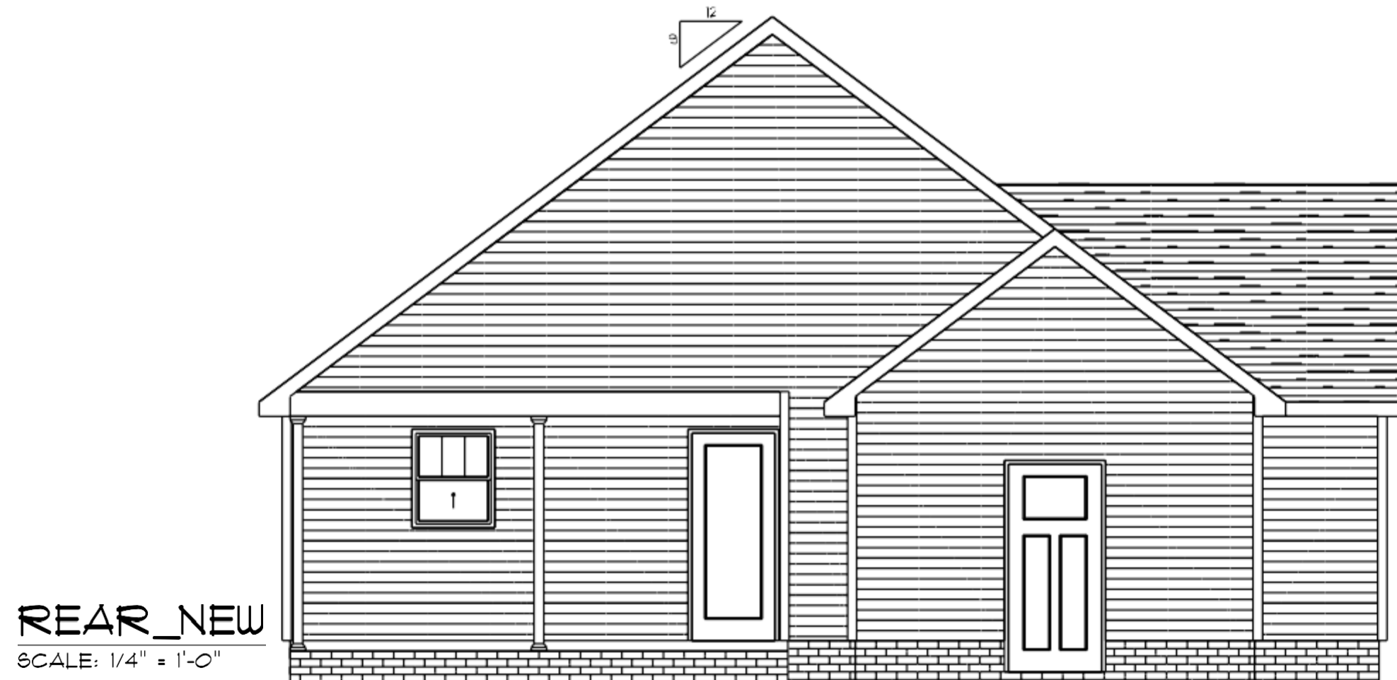
REAR_NEW SCALE: 1/4" = 1'-0"