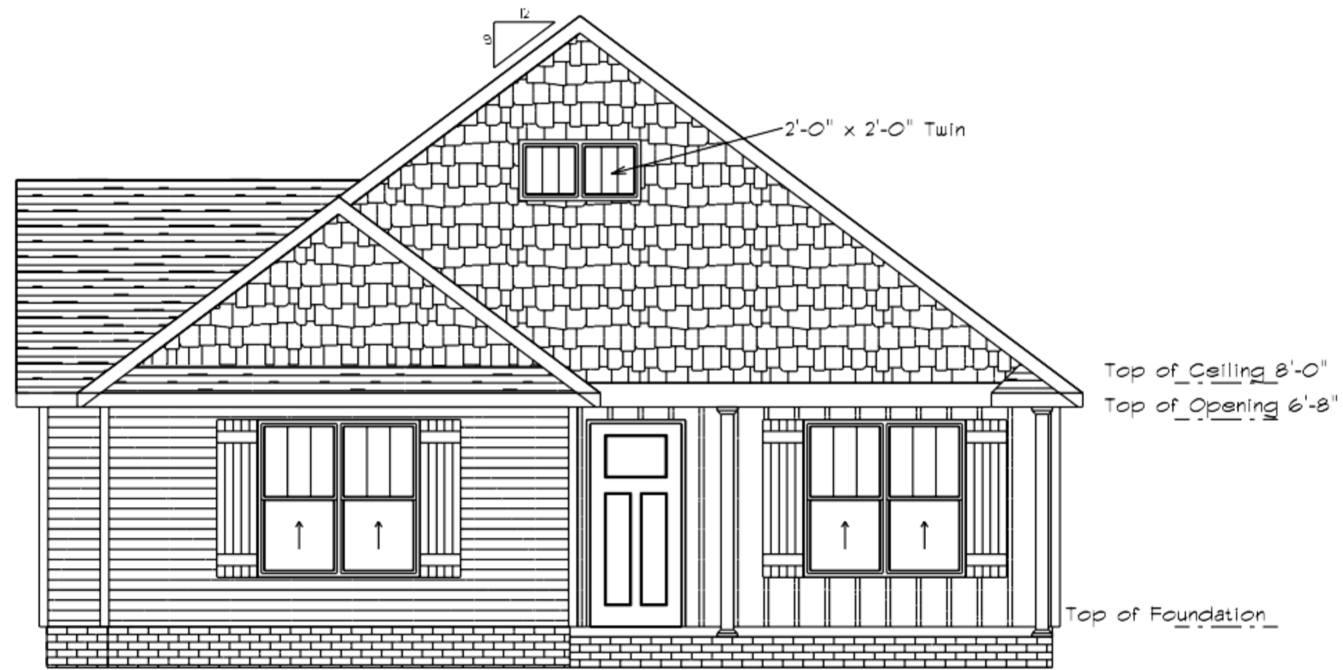
FRONT_NEW SCALE: 1/4" = 1'-0"