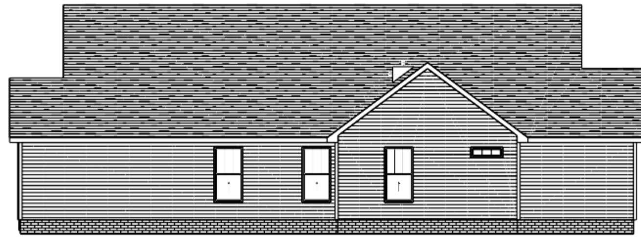
LEFT_NEW SCALE: 1/8" = 1'-0"