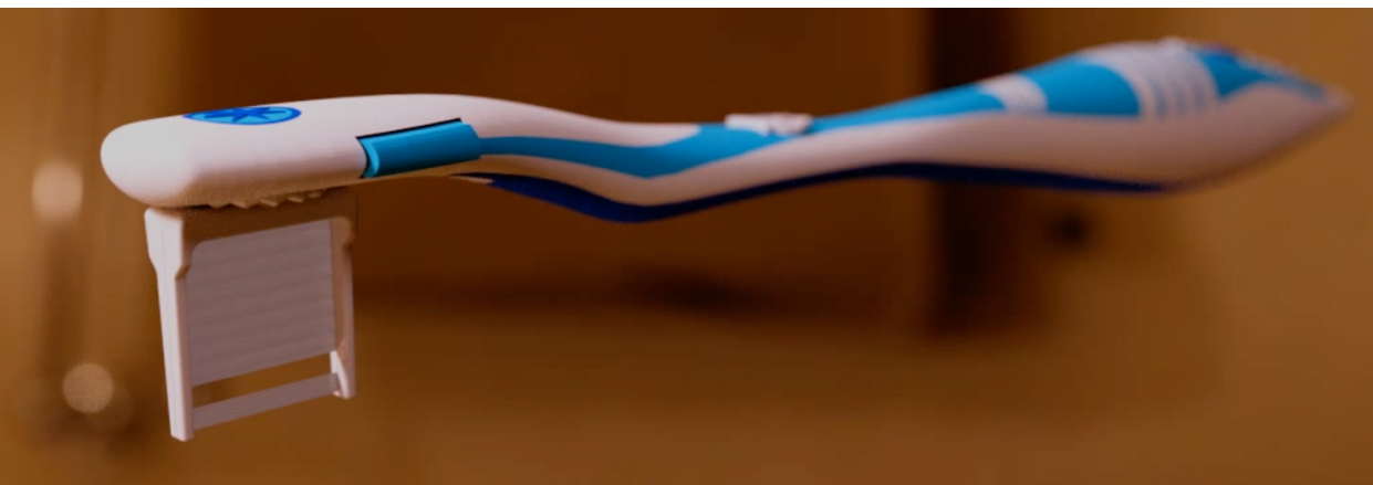
HGOC's Full-Size Ergonomically-Designed Flossing Handle with Replaceable Floss Heads

As the bottom ribbon cleans below your gum line, lifting bacteria, plaque tarter and food particles, its' open area between the bottom ribbon and top ribbon captures and lifts bacteria, plaque, tarter and food particles out of your gum line. At the same time, the top ribbon removes this disease causing bacteria from the rest of your teeth all the way to the crown! Plus, it will prevents unsightly stains from forming between teeth.