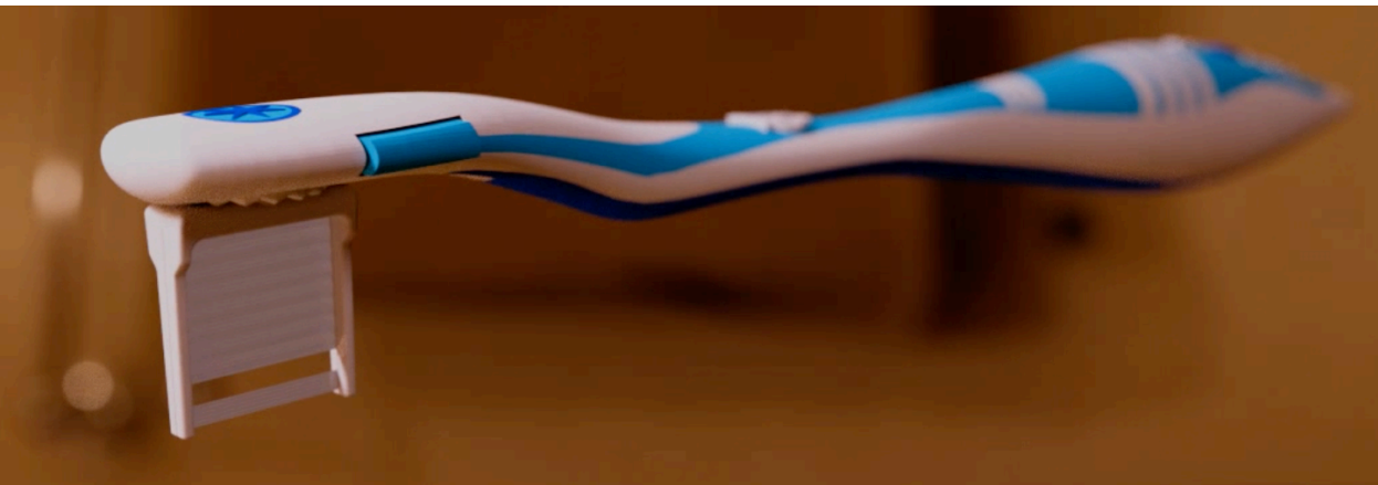
HGOC's Full-Size Ergonomically-Designed Flossing Handle with Replaceable Floss Heads

As the bottom ribbon cleans below your gum line, lifting bacteria, plaque tarter and food particles, its open area between the bottom ribbon and top ribbon captures and lifts bacteria, plaque, tarter and food particles out of your gum line. At the same time, the top ribbon removes this disease causing bacteria from the rest of your teeth all the way to the crown! Plus, Engage prevents unsightly stains from forming between teeth.