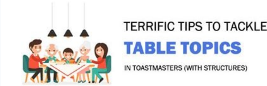
Table topics are a staple food from Toastmasters. This enables us to think independently and improve our improvisation skills. The improvement of this ability is not only important to become a better speaker, but also for improving our communication in general.

Join a club, found a club, contact us with me. My profile topics are a toastmasters meeting session in which we can practice spontaneous speaking. This session is moderated by the Topic Master (TTM) table. It challenges the members (and also the guests) and gives them discussion material for at least a minute.