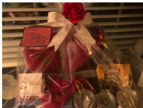
Both from Lakewood