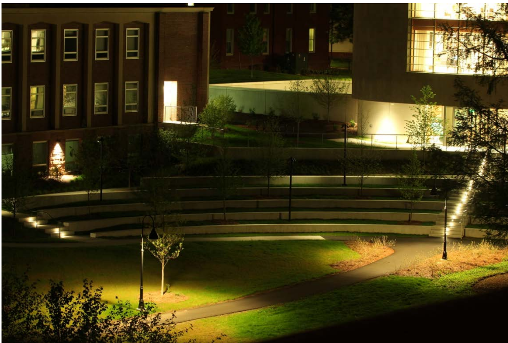
Figure 9: Amphitheater, Nielson Library, Smith College. Post-top fixtures on terraced seats are fully shielded against glare, allowing low illumination levels less than 0.5 fc with excellent visibility and safety and warm, inviting ambiance. Note that the light fixtures themselves are practically invisible in this photo, a sign of successful lighting design; contrast that with the high-glare lights in Pulaski Park.

Both the IES/IDA best-practice recommendations and the spirit and much of the letter of the Northampton lighting code are seriously violated with the proposed lighting. Light pollution is a serious problem that is growing worse every year. Now is the chance to help turn back that tide, not accelerate it.