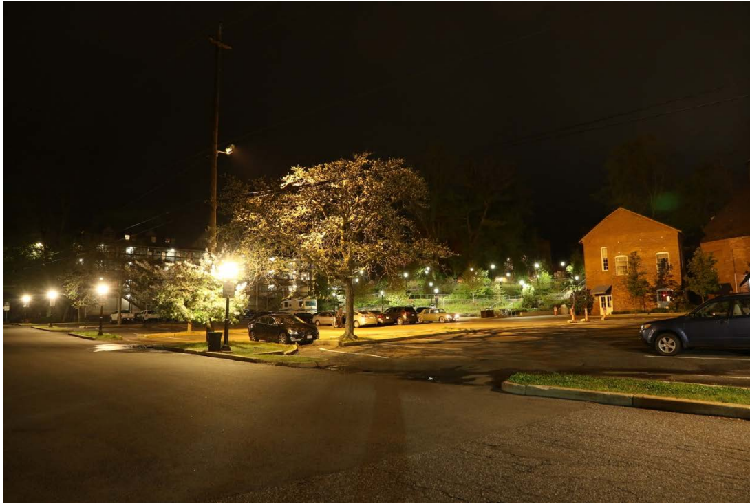
Figure 5: Roundhouse lot with current lighting. Note apartment building at left, Pulaski Park center rear, and Roundhouse at right. Current light levels range from about 1.5 fc directly underneath post-top lights to less than 0.05 fc. Proposed lighting would increase illumination levels virtually everywhere in the parking lot, with significant glare and light trespass into neighboring residences.