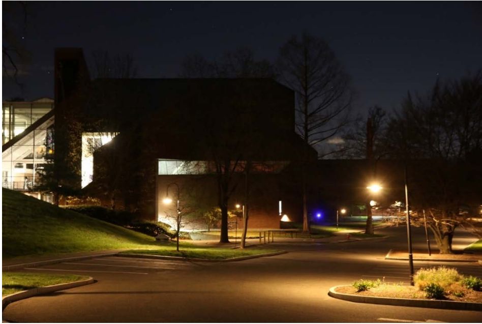
Figure 8: Parking lot outside Ainsworth Gymnasium on the Smith College campus in Northampton. The fixtures have LED lights (2700K) that provide maximum illumination of 1.0 to 1.5 fc, with average values less than 0.5 fc. The proposed lights in the Roundhouse Lot would cause illumination levels more than 4x brighter with much worse glare.