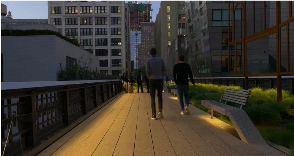
Figure 3: The High Line park, New York City. Lighting is carefully designed to avoid glare and overlighting. The result is a warm, inviting ambiance with excellent visibility. The proposed Roundhouse Lot lights would be more than 10x brighter with much worse glare.

illumination. We are not aware of any evidence showing that that illumination has been established as the cause of any risk to personal safety or property, from crime to tripping. On the contrary, there's much more than enough light now to see where you're going anywhere in the lot. To provide illumination levels even higher than 1.5 fc over most of the Roundhouse Lot as planned, the new lights would necessarily be much brighter, with much worse glare.