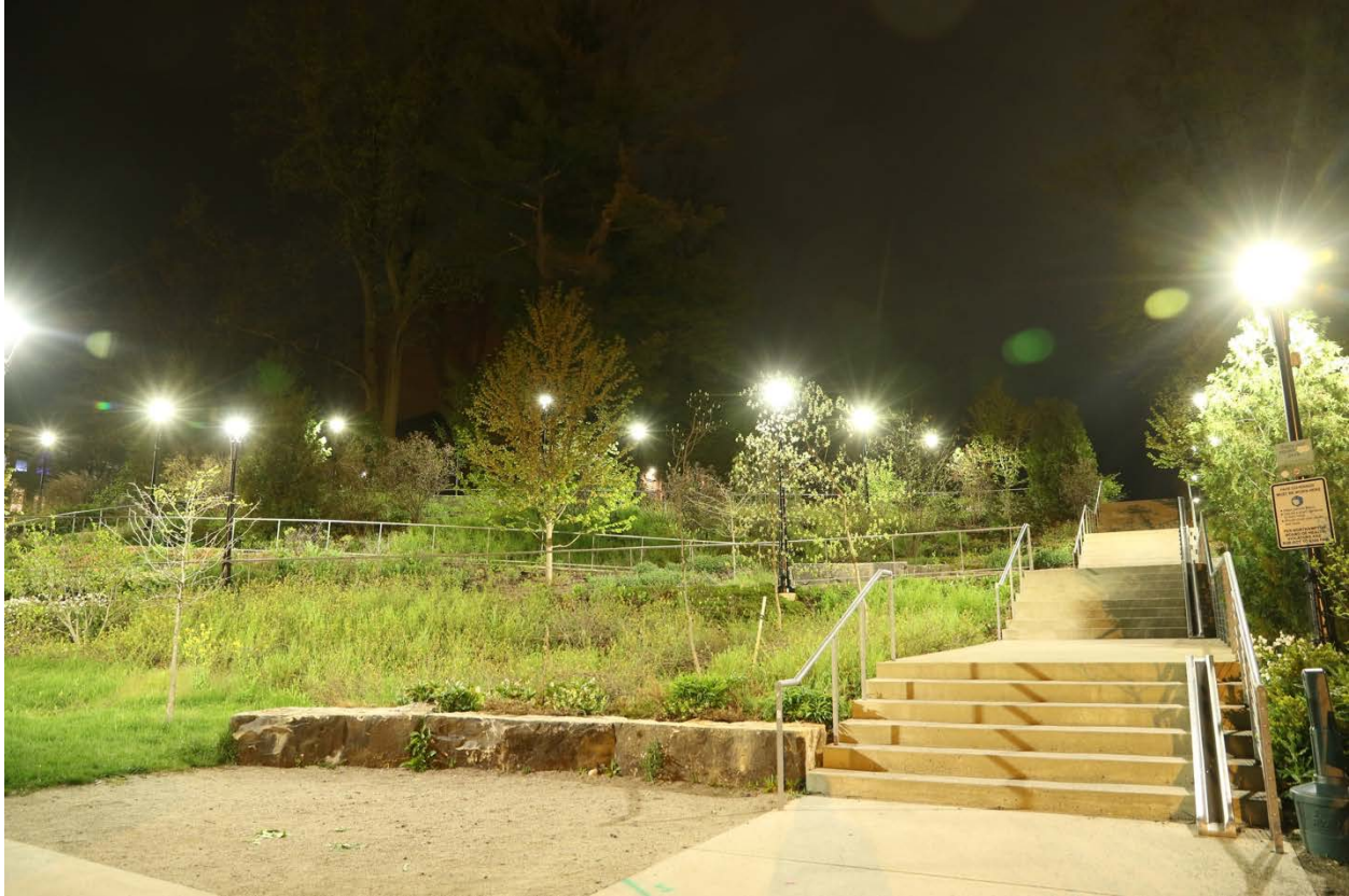
Figure 2: Light fixtures in Pulaski Park, Northampton (MetroScape, 4000K, 37W, 3450 lumens) have similar design to fixtures in the current proposal for the Roundhouse Lot. These lights are excessively bright -- 10x brighter than lighting in some parks in New York City -- and cause significant glare. The proposed Roundhouse Lot lights would be up to 2x brighter with even more glare (3000K, 54-81W, 4400-6600 lumens). Note the pollinator garden, illuminated all night long with bright blue-rich light known to be harmful to insects including pollinators.

The glare is very significant: all the lights are like a sharp poke in the eye seen even from across the street. A prominent award-winning lighting designer walked there a few years ago and was shocked at how bright and how poorly shielded against glare they were.