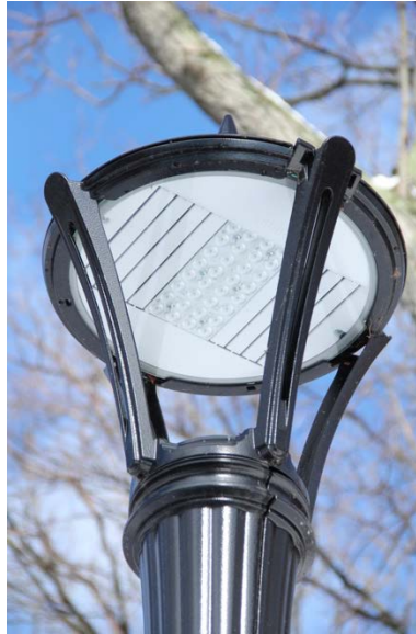
Figure 1: Lumece MetroScape light fixture currently in Pulaski Park; same fixture is proposed for Roundhouse Lot.