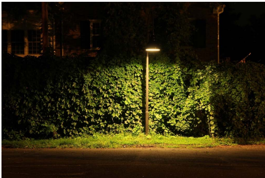
Figure 7: Gooseneck style lighting fixture in a Smith College parking lot. Glare, color, and brightness are all well controlled, enhancing visibility. (Sternberg, 13W, 2700K.) The lights proposed for the Roundhouse Lot would be 4-6x brighter, with significantly more glare.