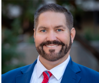
District 5 (Northeast Mesa)