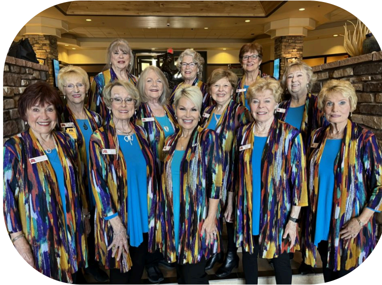
Republican Women of Prescott Singers

Mesa Republican Women is pleased to welcome several talented and patriotic ladies from our sister club, Republican Women of Prescott, the largest club in the country, who will perform a medley of stirring patriotic songs. Their voices will lift your spirits and set the tone for a heartfelt celebration of freedom!