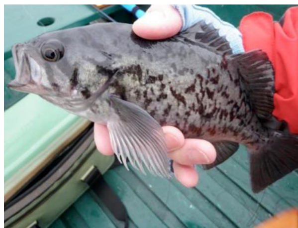
A "Blue" rockfish, one of several varieties that you might catch.

beat the check-in rush. Once everyone is checked in, we'll pick out a restaurant order a few brewskies and a seafood