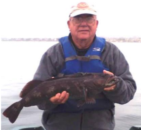
The prez with a fly caught ling cod from a previous Santa Cruz outing

While the target is kelp bass, don't expect to see any kelp. You'll be fishing in water 30 feet deep over rocky high spots. You won't have to fight casting into a maze of vegetation. If you find that the bite has fallen off, you've probably drifted away from the pinnacles,