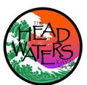
We specialize in fishing kayaks and even have a small fly fishing section featuring rods, reels, lines and delta flies.

<u>www.excellentadventures.org</u> <u>Al Smatsky, Proprietor</u> 619 W. Pine Street, Lodi, CA 95240 (209) 368-9261, (209) 601-0819 cell 1/14