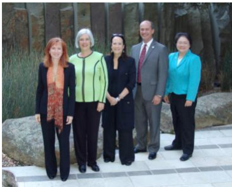
The State Water Control Board members

with a final meeting to be held January 3 in Sacramento. It is crucial that the SWB moves forward to initiate these flows.