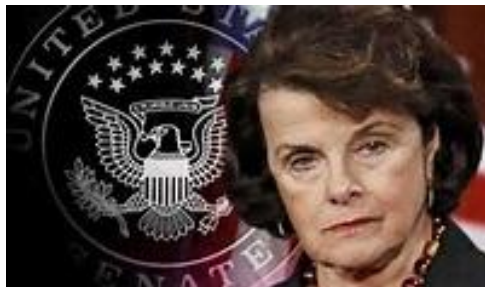
Senator Dianne Feinstein

She also talked about a farmer who was in her office "with tears in his eyes" because the lack of water in the drought which caused him to lose the family farm. Records show however, the farmer miscalculated the amount of water he would receive from the state and federal water projects in 2009, three years before the drought. Again she misrepresented the truth.