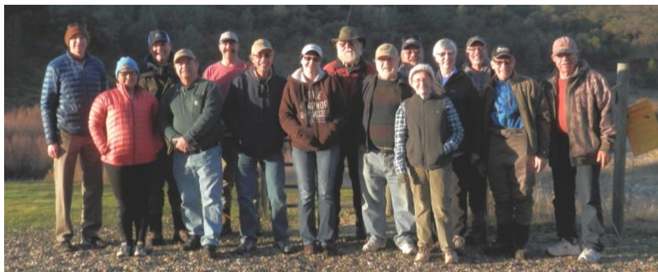
The Yuba, "Wild Bunch"

For those familiar with past outing at this location above the Hwy 20 Bridge, UCD made some significant changes this fall. First, the entrance gate had a combination lock which the attendees could freely come and go without the need of a key. UCD did away with a staff member opening its property and did not issue individual passes. Lastly, UCD closed their north trail to the upper section of the river. This was a disappointment to several club members who consider that section one of their favorite reaches to fish.