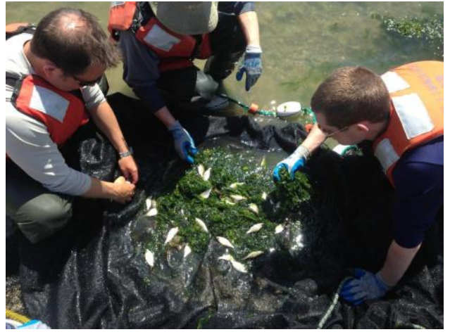
Toxicologists examining fish samples

We know that the Delta is also polluted with a wide variety of toxins. The Bay area cities are allowed to discharge over 1,166 acre feet treated sewage into the Delta and Bay on a daily basis. How is this effecting our ecosystem? We need to start testing our own ecosystem to see how much damage is being done to the Delta and our fisheries.