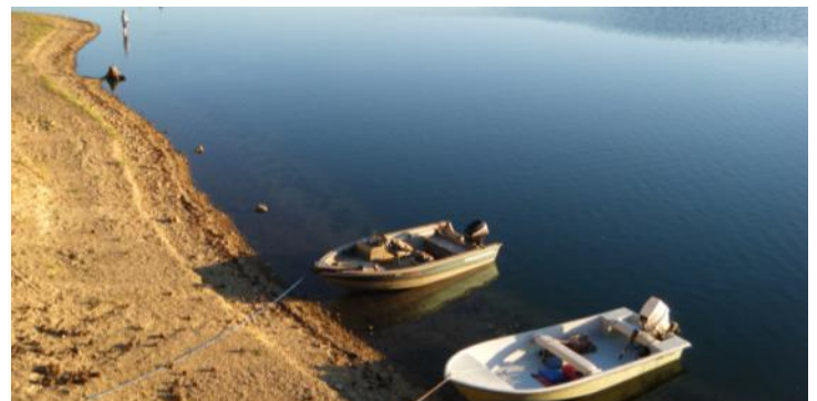
Lake Davis from base camp at Grasshopper Flat campground...