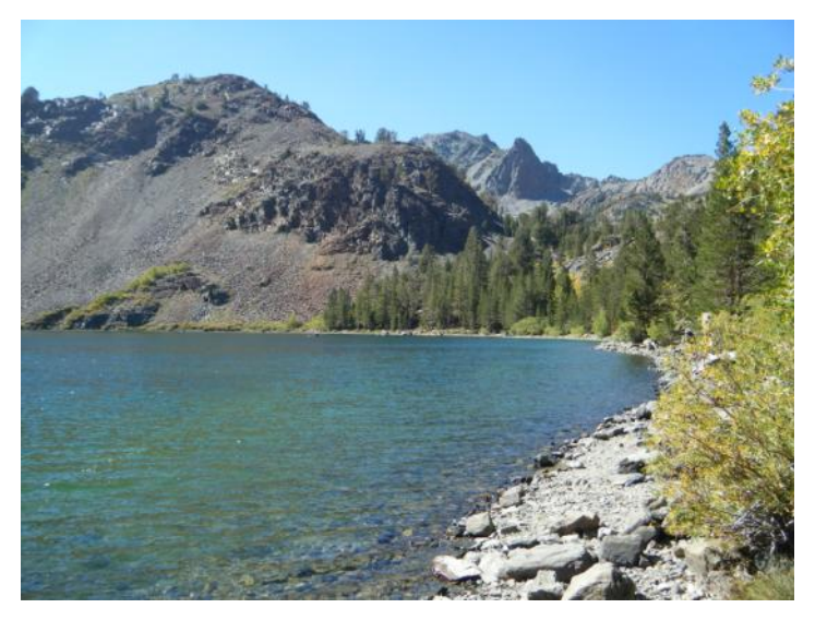
Upper Virginia Lake, at the top of the Sierra Nevada.