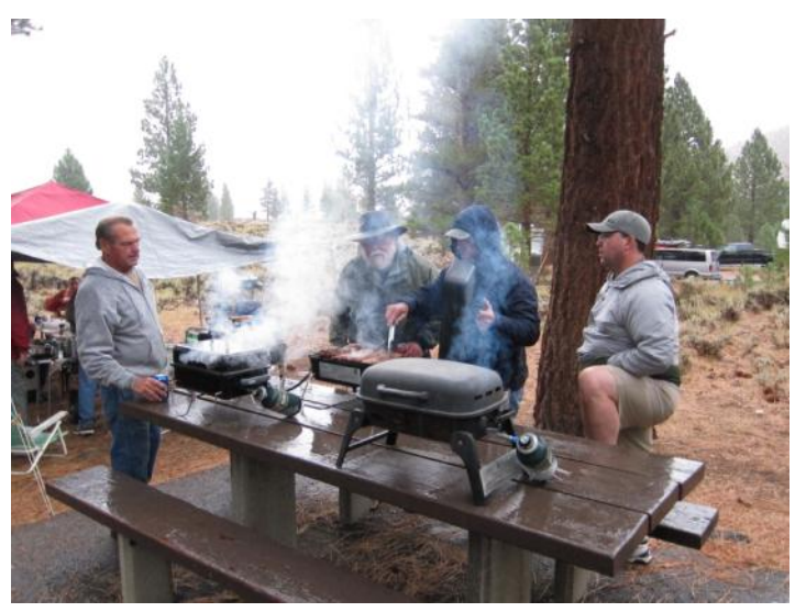
Is that steam or smoke coming off those barbecues?