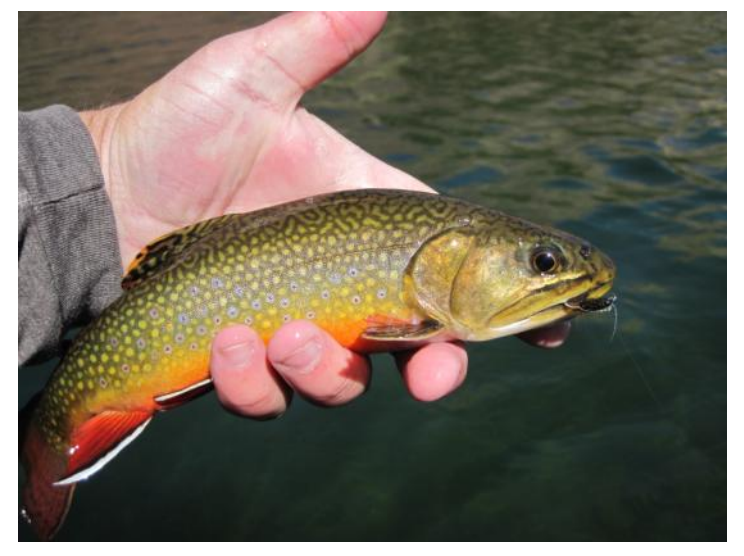
A beautiful little brook trout, too pretty to eat!