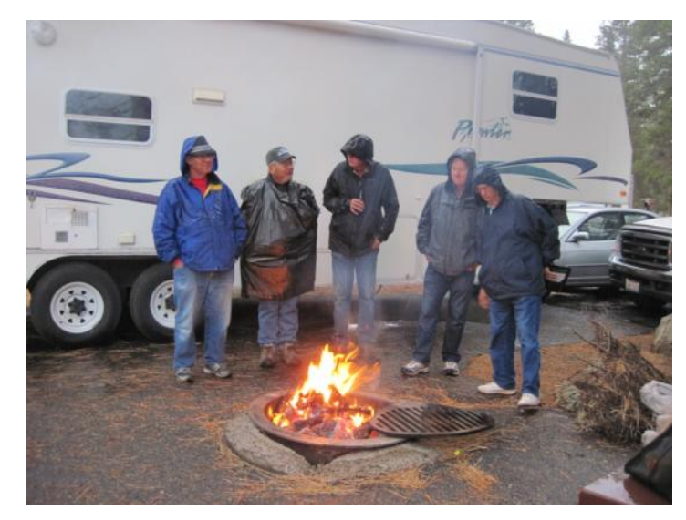
Another sunny day in the Eastern Sierra