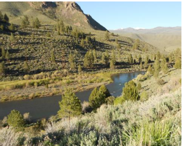
The West Walker, flowing at 500 CFS

The only thing that I have in common with Indiana Jones is our repulsion for anything that slithers! When wading the west Walker, I couldn't help imagining another motivated snake wanting to cross the river, using me as a resting stop. The west Walker does not flow into the BP reservoir and the river had lost my favor. We had day light left and the East Walker was calling again. We raced to it and was able to get there for the late dusk fishing. We both lost fish that will linger in the dark recesses of memory and we will remain helpless to only revisit that continued on page 4