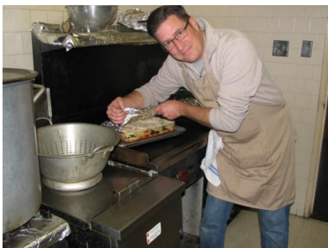
The vegetarian lasagna was rated five star!