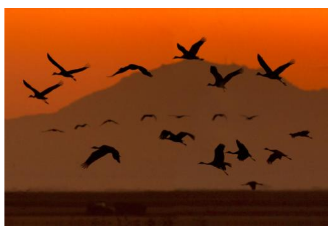
Sandhill Cranes.