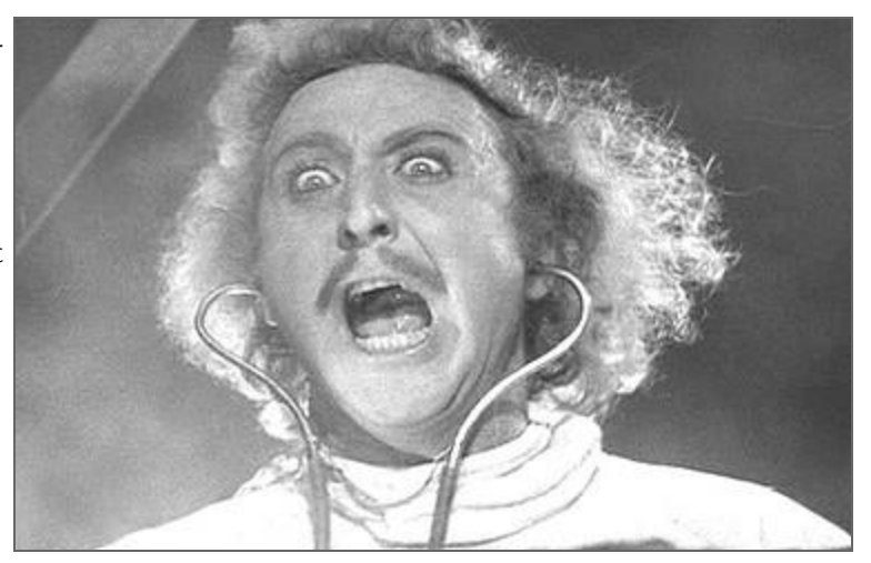
It's alive! It's alive!

end its public input session and make its decision whether or not to allow <u>Aquabounty Technologies</u> (AT) to raise, farm and sell Atlan-