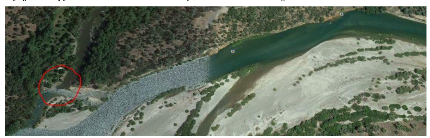
The Sycamore Ranch R.V. Park take out point on Sycamore Slough. The park features an improved ramp for easy take out with parking for vehicles and trailers. The ramp is barely visible from the river proper. Anglers planning to use the ramp should have a good idea of its location and be on the north side of the river when approaching Sycamore Slough.