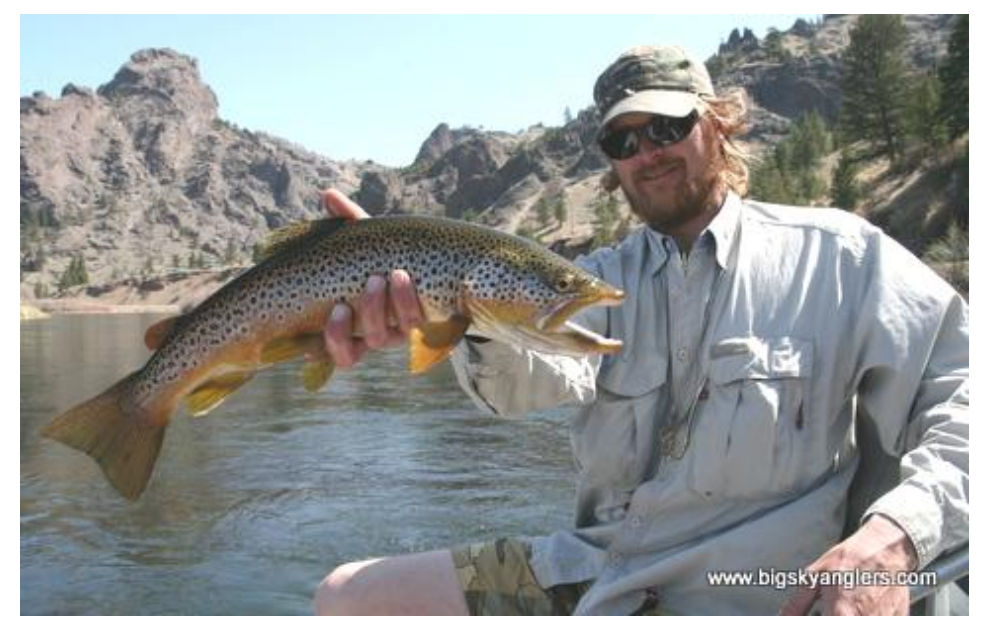
This is truly just an average fish for the Missouri below Holter Dam. If you're dialed in and the fish are cooperating, you might expect as many as 30 of these a day.

BLM operates three campgrounds, one at the base of Holter Dam, one at the bridge two miles below the dam and one at Craig. All are small and busy. No hookups. Water only.