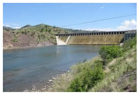
Holter Dam on the Missouri.

activities so I headed out by myself, driving the five miles from our RV Park to the river. As I drove along the bank, I could see the rings of working fish. I found a spot to pull off with soft water near the bank and lots of rises further out. While some fish were feeding on top, I suspected that others would take a well presented nymph and set up my rod with thingamabob, shot and a #16 mayfly nymph pattern with some crystal flash for legs and a body wrap.