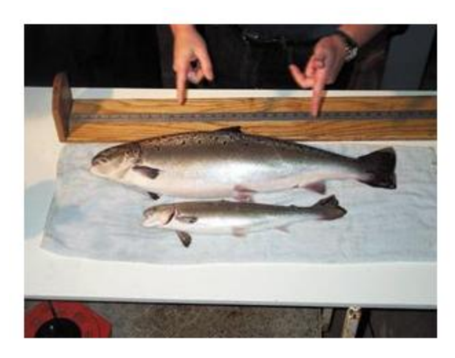
A Frankenfish vs. a normal Atlantic Salmon.

claims, not all eggs treated in their triploid process are sterile. If crossbreeding occurs it could be a disaster for the natural fish and the