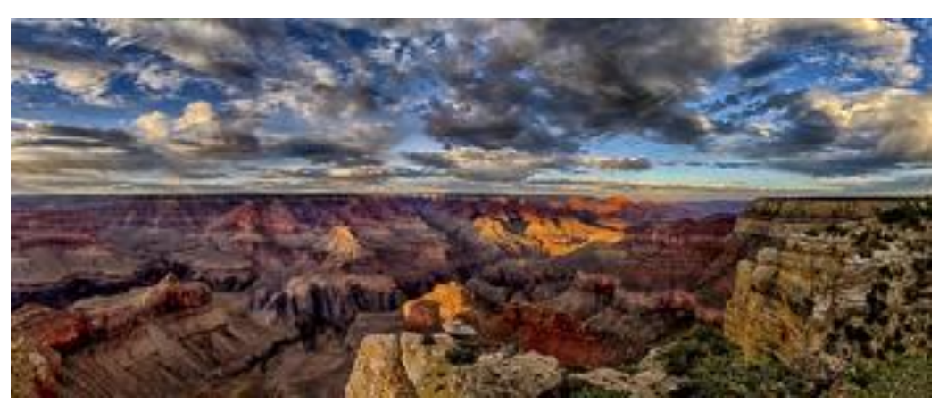
The Grand Canyon.