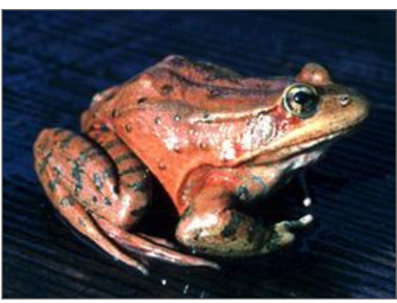
The endangered California Red Legged Frog.

Remember, if you haven't been fishing since Christmas, it's a new year. Don't forget to purchase your 2013 fishing license. You can now buy your license on line at the Department of Fish and Wildlife website. Make sure you have last year's license ready since you'll need your GO number on the face of the license when filling out the form. And, if you fish "steelhead" waters, don't forget to purchase your steelhead report card.