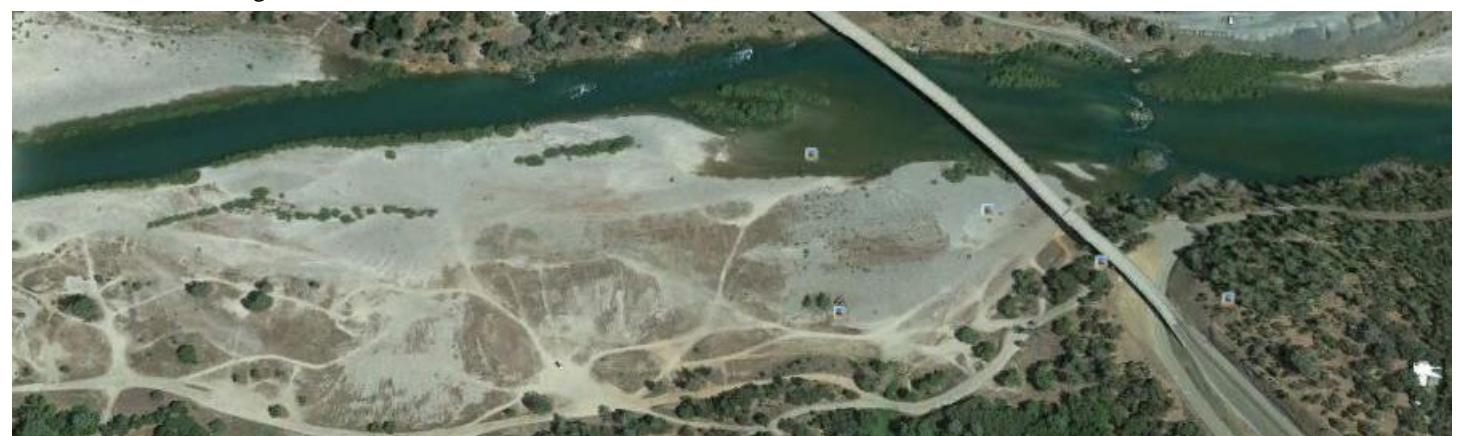
The Yuba at Hwy. 20. Note the numerous dirt access roads on the south side of the river. WARNING, roads close to the river are soft gravel. Only four wheel drive vehicles should attempt these roads.

Pontoon boat, kayak, drift boat, canoe. River anchor. Life Jacket, oars or paddles.