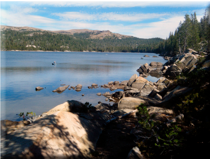
Few club members enjoying float fishing Alpine Lake during the club's trip on October 15th.