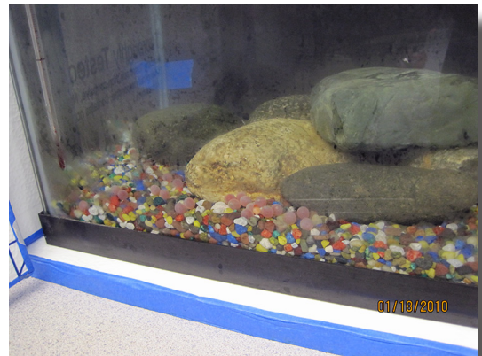
Eyed Chinook salmon eggs