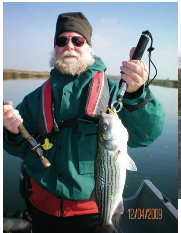
Santa's 1st Striper!