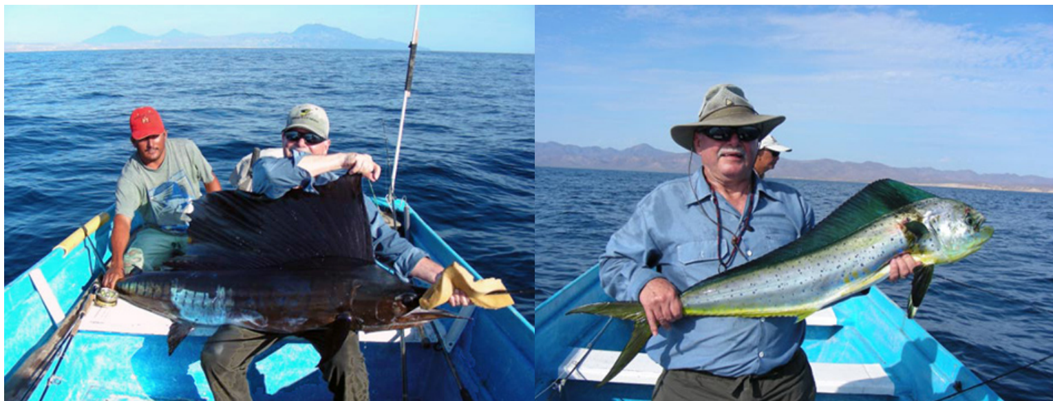
Another Blind Squirrel Finds Another Nut(s)

Mail the form to: Delta Fly Fishers P.O. Box 77862, Stockton, CA 95207