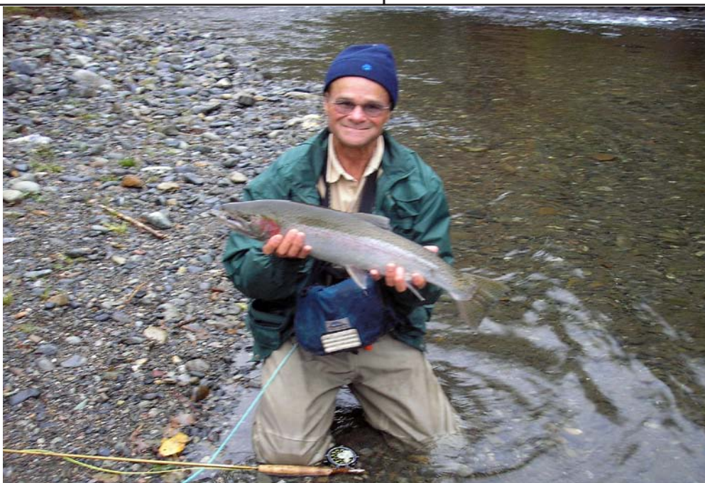
Trinity River Steelhead

Mail the form to: Delta Fly Fishers P.O. Box 77862, Stockton, CA 95207