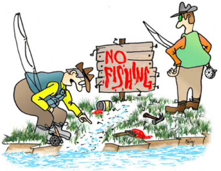
"Hold the phone! This is a trail of fin tracks leading into the river!"