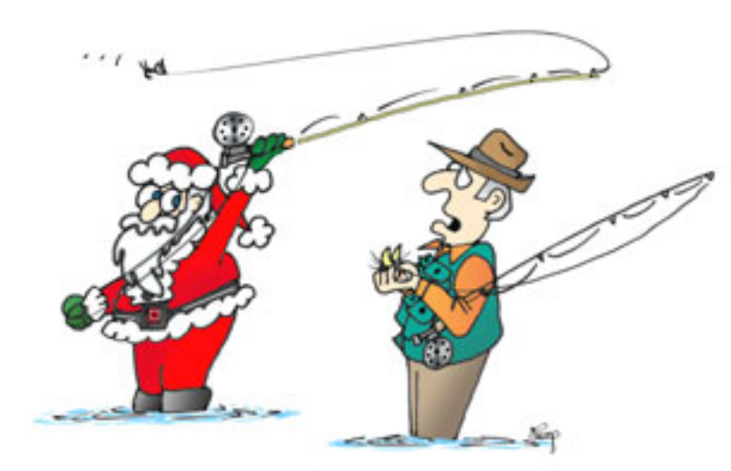
"Strange. Your fly rod looks just like the custom model I requested for Christmas and didn't receive."