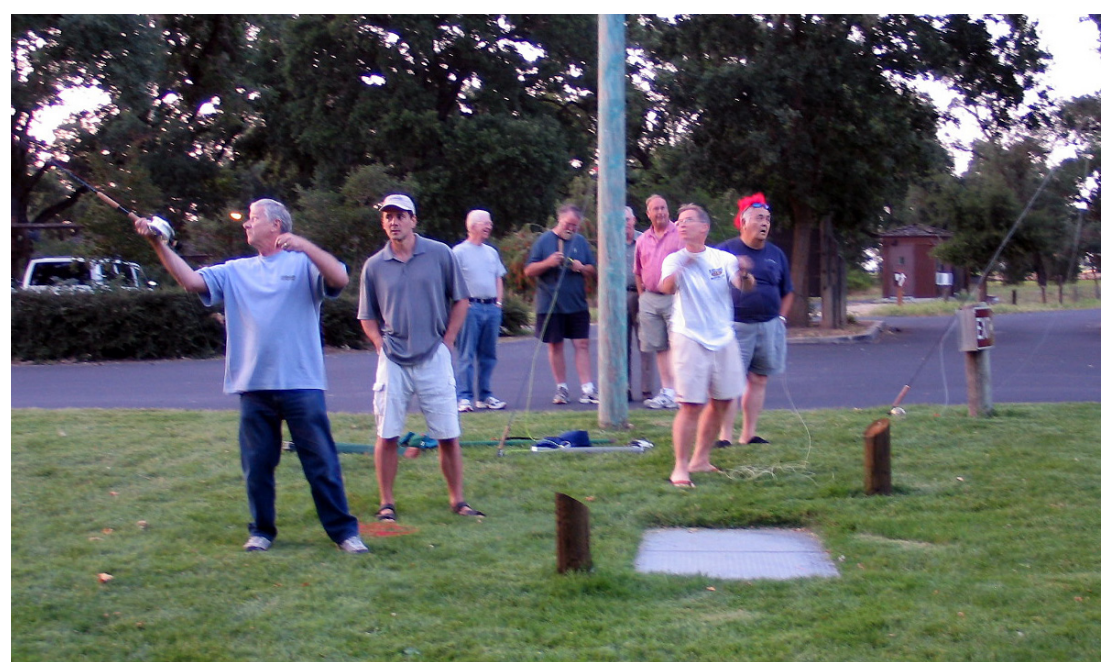
Free Fly Casting Lessons

Help your club with an upcoming fundraiser by donating fishing or non-fishing items to a garage sale to be held Saturday, June 16 at 115 W. Vine St., Stockton. Your donations are tax deductable at current market value. To arrange for delivery of your donations contact Jake Loyko at (209) 981-4676 or by email at j_loyko@ hotmail.com.