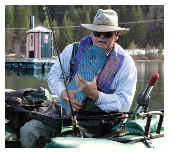
I can't believe that I forgot to untie my boat!

That was the story he told. But inquiring minds want to know more. So, after much research, it has been determined that probably what happened was that he tied up to use the outhouse. When he got back into his pontoon boat, he forgot to untie the outhouse. So the faster he rowed the faster the outhouse was coming after him. No wonder he couldn't loose it.