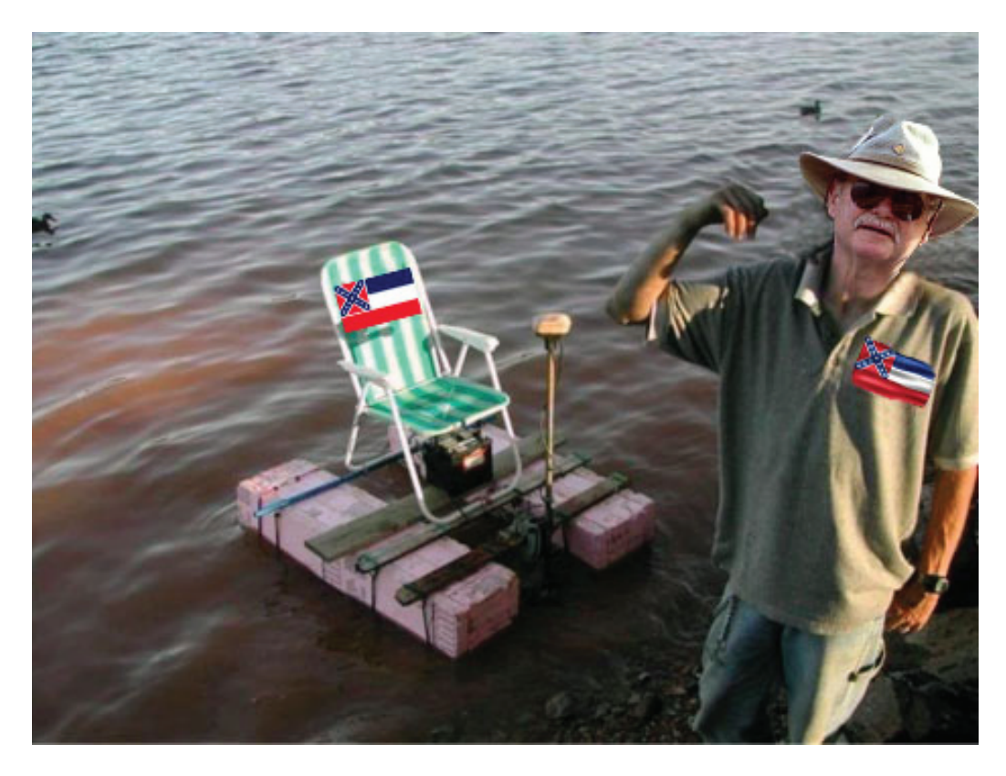
Grady's new Pontoon boat Converted from an old Confederate Navy gun boat

Contact person, Bob Souza 607-6604 or suzasbs@clearwire.net