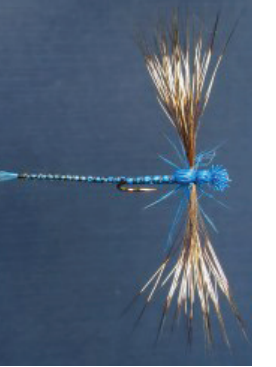
Grady's Confederate Navy Houseboat

We were booked to fish the harbor Monday, February 19, with Jeff Stock, but a storm moved on shore late Sunday night. We saw the heavy downpour and high winds the next morning we were glad not to be out in white capped harbor.