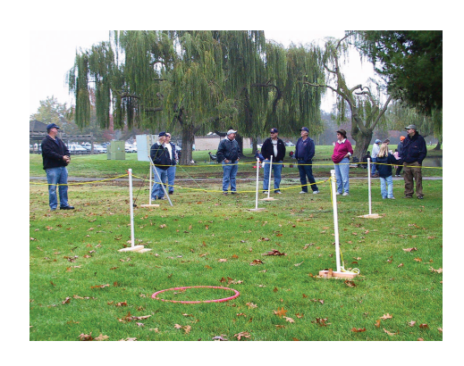
Casting For Kids