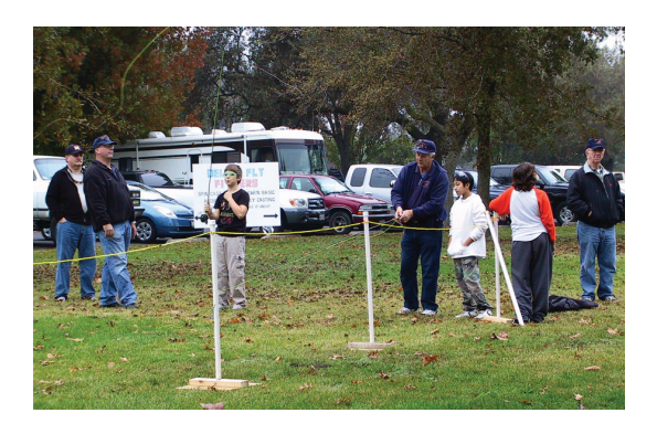
Eager New Fly Casters