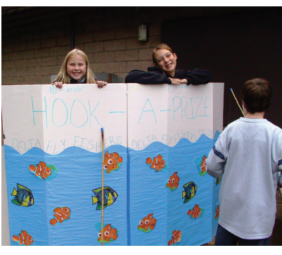
The Fish Behind The Screen