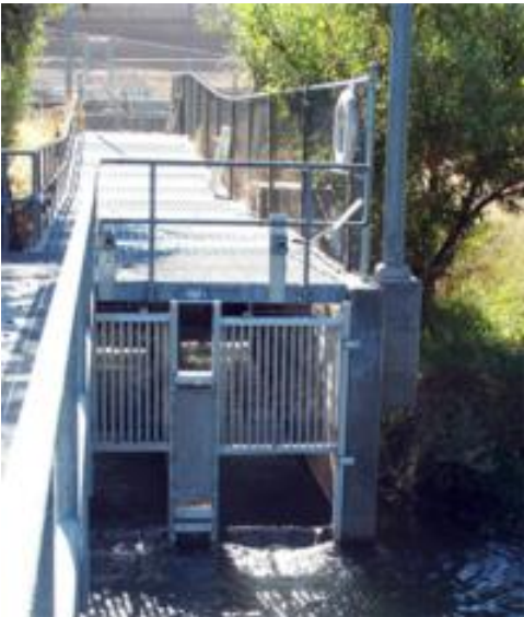
The fish ladder at the Mokelumne River Fish Hatchery. It's been busy this year.