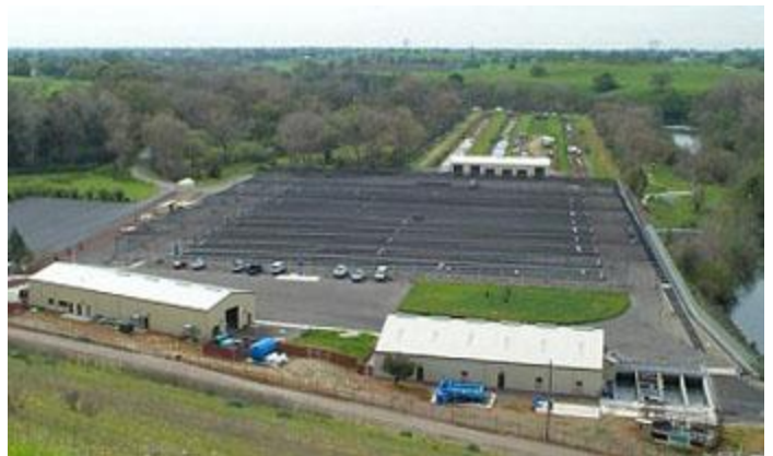
The Mokelumne River Fish Hatchery below Camanche Dam. (Continued on page 3)