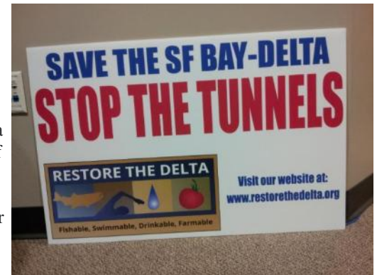
Grass roots in action. I have one in my front yard.

1.) From the first of 2018, Governor Brown promised that we would "break ground" on his Twin Tunnels Project. He has not. RTD and our coalition partners have effectively exposed the pseudoscience, lies, half truths, and blatant ille-