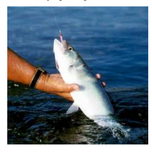
system to start fly fishing for them in the Rancho Cordova area.

very fluid and washes away easy under foot. Another key date to remember is the second Sunday of May (Mother's Day). This is my indicator that shad should be up high enough in the river