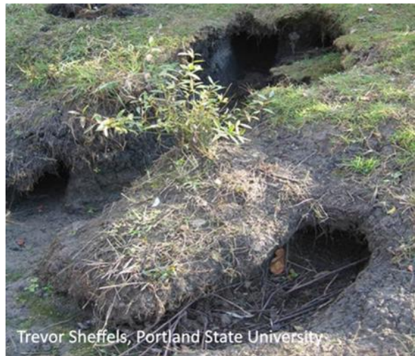
Trevor Sheffels, Portland State University

Both water interests and farmers in the Delta have good reason to be terrified of this invasive species. Nutria are nocturnal invasive swamp rats. Today they are wreaking havoc with the Delta's environment. They are voracious herbivores. Every day they consume up to 25% of their body weight with plants growing above and below ground. Because of the nutrias feeding habits, they destroy an additional 10 times more of plant material than they consume. This causes a devastating loss to existing plants, Delta crops, and to the integrity of the soil. The nutria will burrow over 160 ft. into levees and banks to create a vastly complex sys-