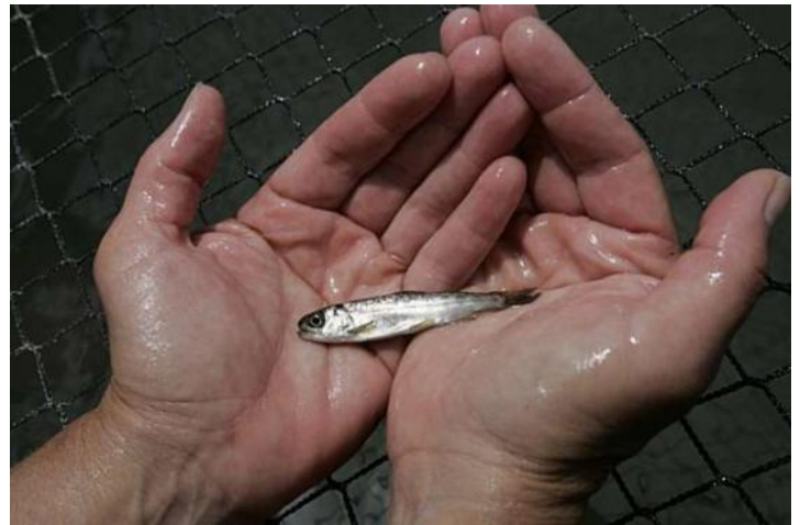
A salmon smolt, hope for tomorrow.

Before that last drought ended, the EBMUD, biologist and the CDWF staff at the Mokelumne Hatchery conceived a variety of innovative, creative techniques and methods to off-set predation and fish loss in the Delta and rivers for returning salmon. Their innovative techniques are working. Now over 20% of all commercial salmon harvested in California were from the Mokelumne River. Not too bad for the state's smallest hatchery!