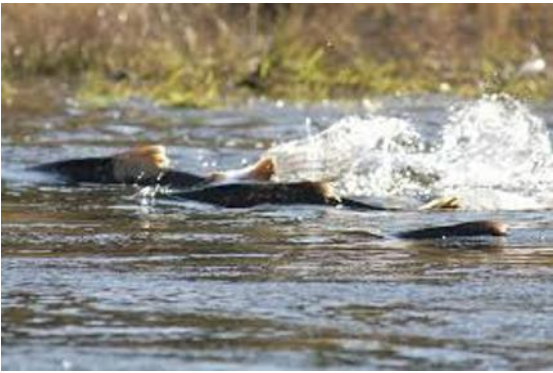
Two old ladies, giving their last efforts to bring new life into the world.

Northern California last year (150% to 180% above normal) the salmon benefited. The spawning habitat lost by the building of Comanche Dam on the Moke-