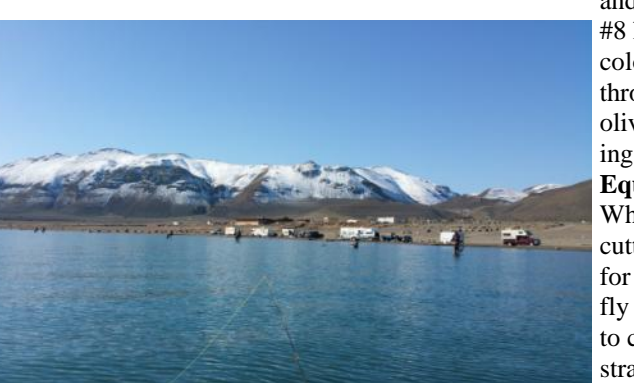
One of those bluebird days at Pyramid, great for camping, tough for fishing.

Balanced leeches are also popular with many fly fishers fishing both a balanced leech and chironomid under an indicator. The balanced leeches usually have crystal flash bodies, marabou tails and no palmered hackle for a final winding. Sizes