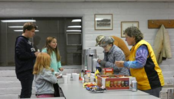
From 2018. Has it been that long ago?

The next thing is the early work crew arriving on Saturday morning about 6:00am to turn on the coffee pots, set out the chili and cheese and start the hot dogs cooking