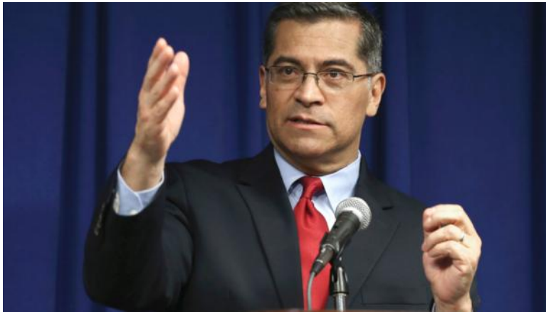
California Attorney General Xavier Becerra.

sentences she gives us five blatant mis-statements.