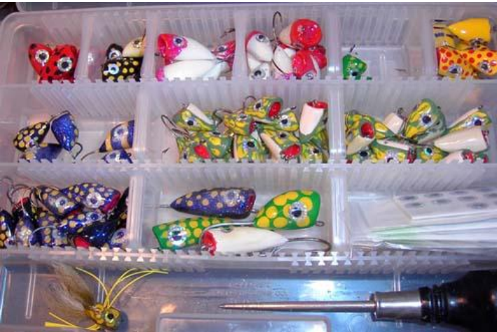
Is this art, fly fishing or both?

The meeting will also feature the second fall mega raffle with fly fishing and camping equipment with a value exceeding four hundred dollars to be given away.