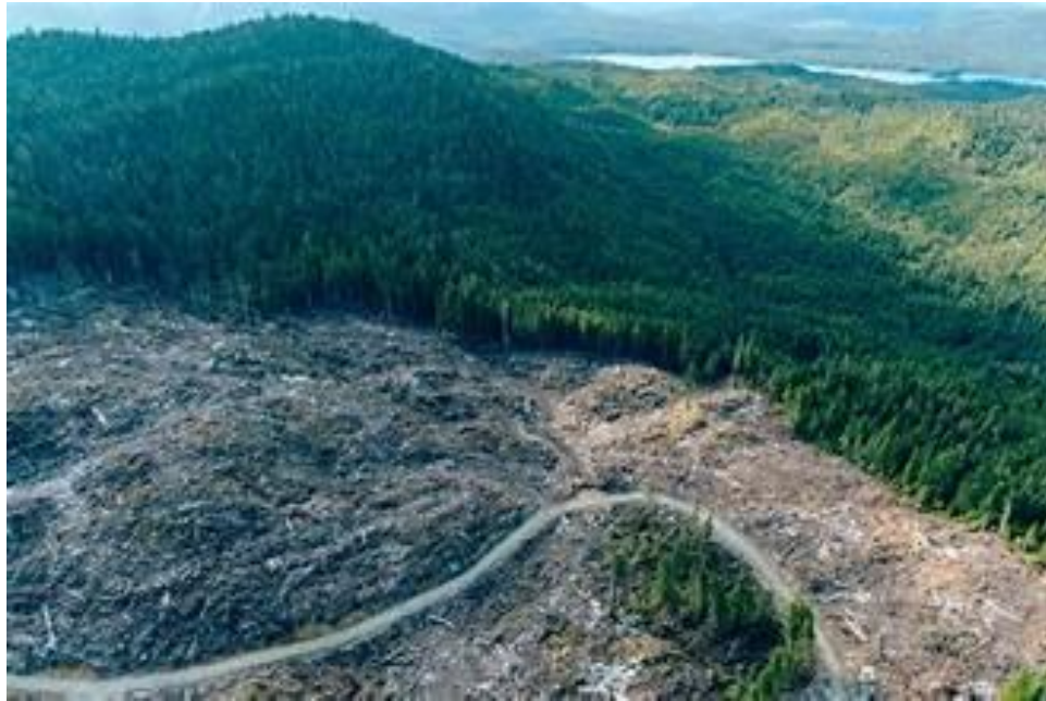
Forest clear cut.

They have a multiplicity of ways to destroy what we have. First, they will remove the Services source of income for staff, and the staff's expertise and authority. They have already gutted 25% of the BLM's staff. They are currently in the process of trying to eliminate all of the FS's research income. They are also actively working on the agency's ability to function with mass firings and initiating programs intended to discourage career employees so they leave the agency. They have broken and initiated programs that serve their interests such as building roads into areas that are currently protected, for logging and mining.