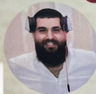
DJ Roy C