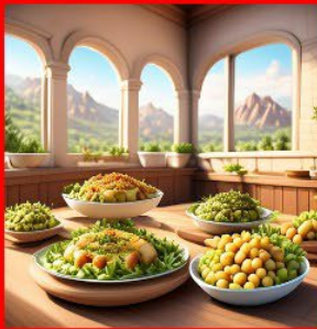
Middle Eastern Food & Desserts