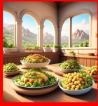
Middle Eastern Food & Desserts