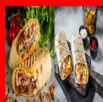
Middle Eastern Food & Desserts

1 Industrial Drive, Shrewsbury, MA 01545