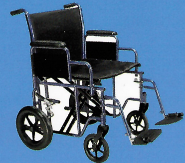
Wheelchairs, Walkers, Canes, etc.