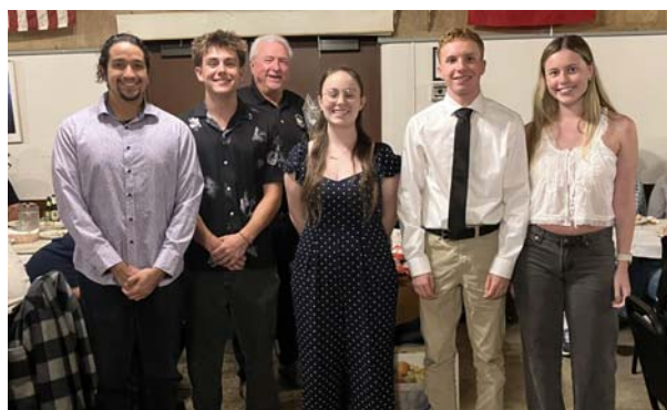
Photo taken at the July Birthday Dinner