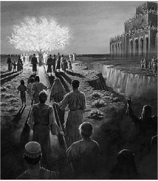
Is this an example of God's grace?