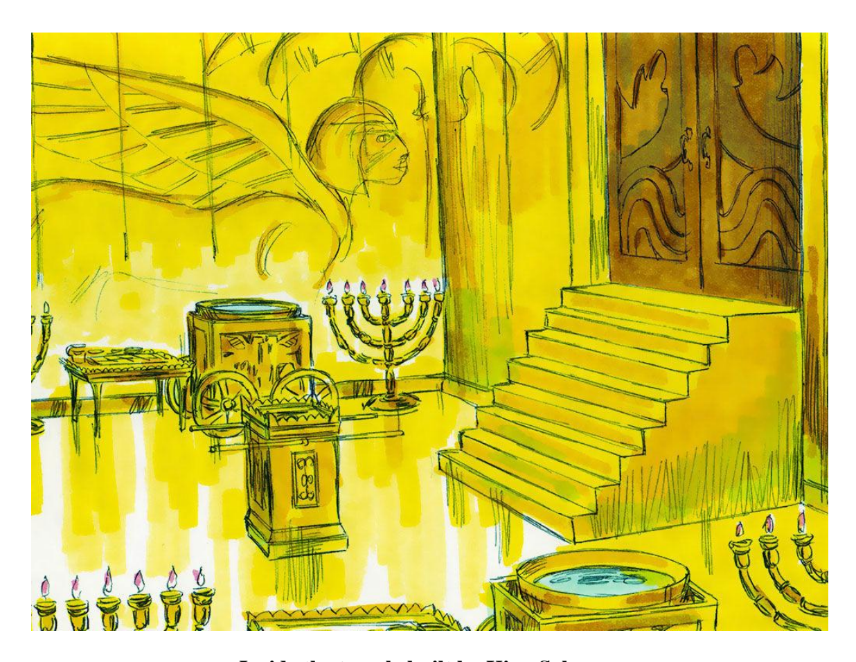
Inside the temple built by King Solomon