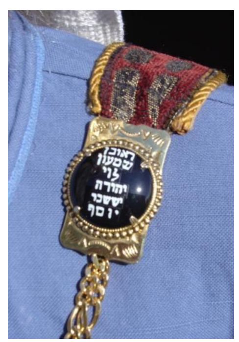
Onyx stone on shoulder