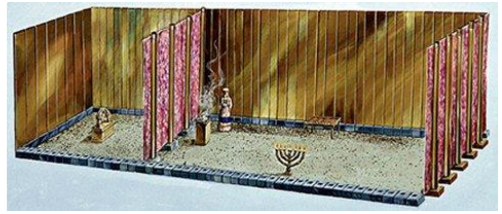
Sockets of silver along base

Exodus 26:22-32 – "29 And thou shalt overlay the boards with gold, and make their rings of gold for places for the bars: and thou shalt overlay the bars with gold. 30 And thou shalt rear up the tabernacle according to the fashion thereof which was shewed thee in the mount. 31 And thou shalt make a vail of blue, and purple, and scarlet, and fine twined linen of cunning work: with cherubims shall it be made: 32 And thou shalt hang it upon four pillars of shittim wood overlaid with gold: their hooks shall be of gold, upon the four sockets of silver."