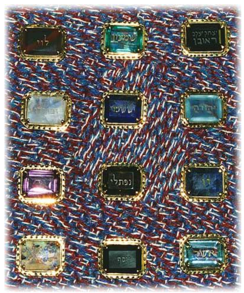
A recreation of the high priest's breastplate from Temple Institute

(Below orders are from right to left.) First row: Sardius, topaz, and a carbuncle Second row: Emerald, sapphire, diamond