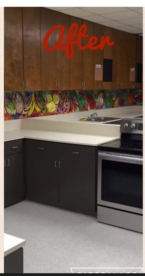
Pro-Start Room before and after pictures