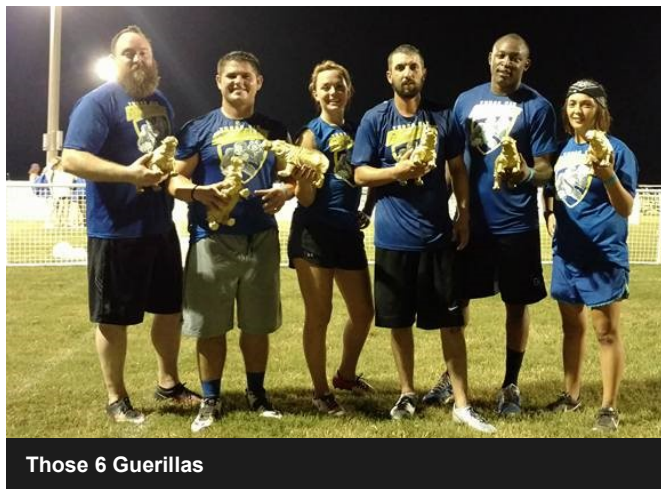
Those 6 Guerillas

The final match came down to last year's winners, Those 6 Guerillas and hometown favorite the Loan Rangers. The Loan Rangers put up a mighty fight, but were unable to prevent a repeat win for Those 6 Guerillas.