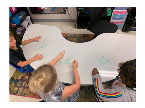
Headstart students using Equipment from Grant

In previous years we have discussed the various grants presented, but this year we will highlight one of the main grants completed last year.