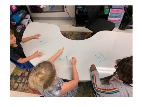
Headstart students using Equipment from Grant

I have certainly learned to appreciate hugs, gatherings, and other things I took for granted. Because of COVID restrictions, many things changed—and so did the look of this annual report.