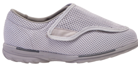
Grey Recycled Polyester