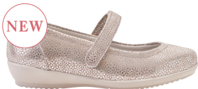
Ditsy Sparkle Leather