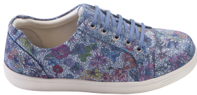
Sky Floral Blue Leather