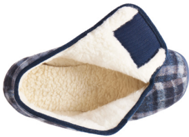
*Warm-lined Blue Tartan Wool-mix