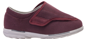
Aubergine Recycled Polyester

Sizes: 4 – 9 • Half sizes available • extra roomy 6E fitting