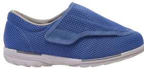
Navy Recycled Polyester