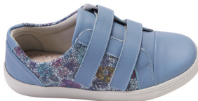
Sky Floral Blue Leather