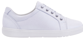
Luna White Leather