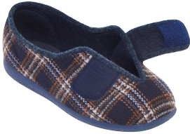
Navy Highland Wool-mix