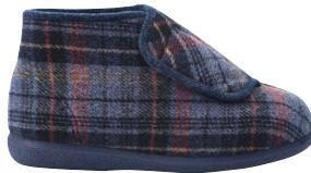
Navy Russet Check Acrylic