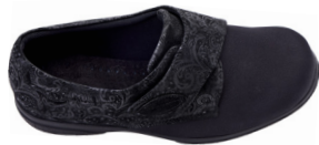
Black Paisley Leather/Elastane