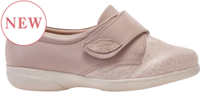
Taupe Mosaic Leather/Elastane