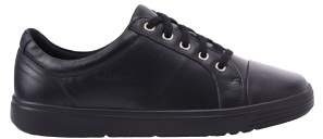
Jet Black Leather

Sizes: 4 – 9 • Half sizes available • extra roomy 6E fitting