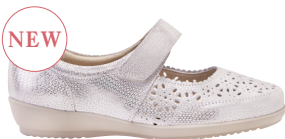
Silver Snake Punch Leather