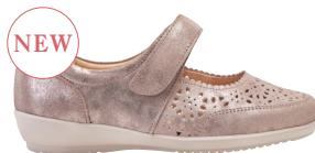
Gold Shimmer Punch Leather