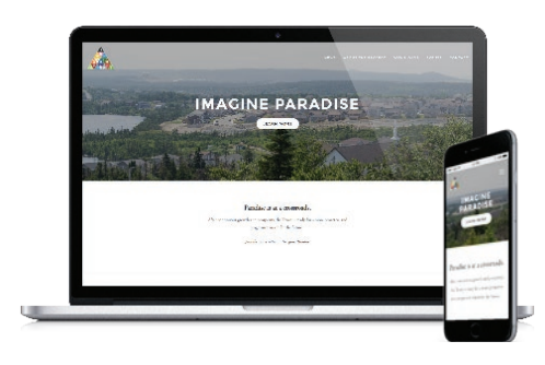
Website developed for the Paradise Plan Review project.