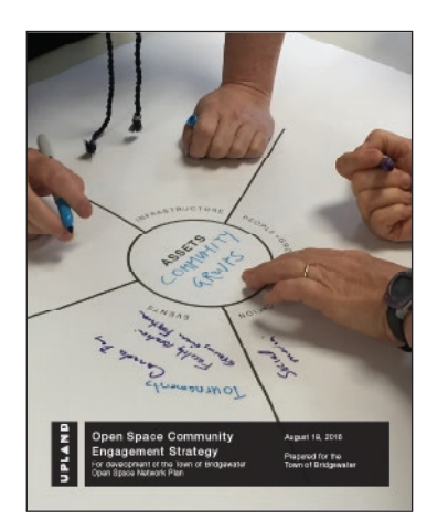
Town of Bridgewater Open Space Engagement Strategy (UPLAND)

UPLAND will ultimately lead the engagement for this project and we have provided recommendations for engagement activities throughout this work plan. However, the approach to engagement should be consistent with the Municipality's Engagement Strategy and supported by the Working Group. The Working Group members are also the local experts on their community.