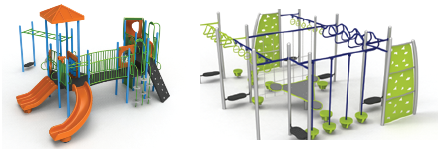
A SNAPSHOT OF THE NEW PLAY STRUCTURES GOING INTO GOLFOVIEW AND MEADOW TERRACE SUBDIVISION PARKS

Two more parks in our community will look very different in the next year, as we replace the playgrounds at Golfview and Meadow Terrace Subdivision Parks. Along with new playground structures, we will be resurfacing the play area to reach today's accessibility standards, making play inclusive for all those in our community. We aim to go beyond playground replacements with our plan, making our parks more inviting spaces for the community to socialize and play.