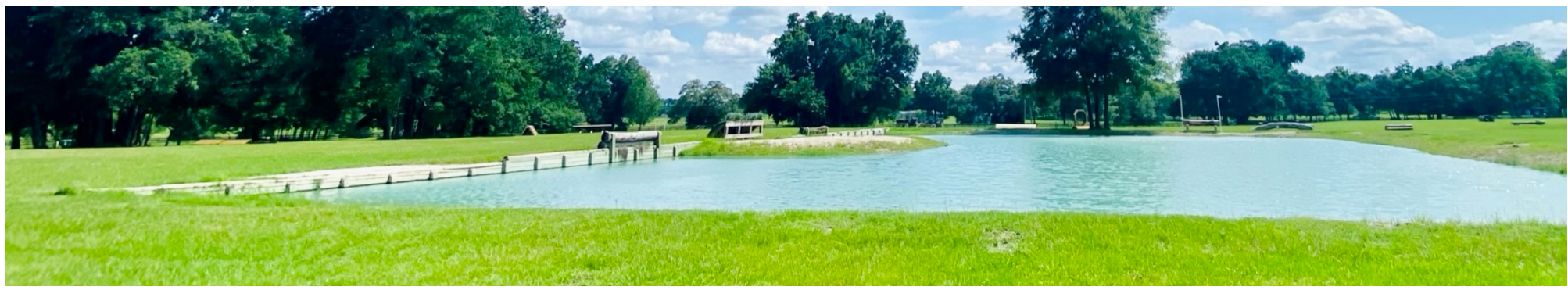
The Main Water Complex at Barnstaple